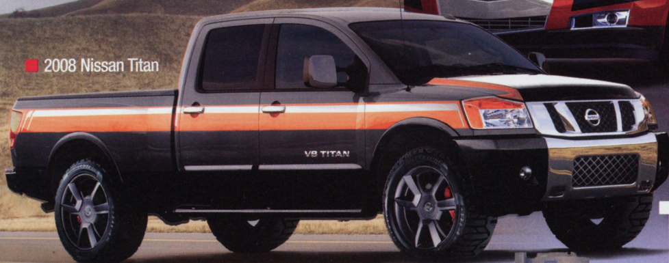
2008 Nissan Titan