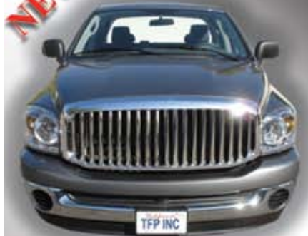
#07560 2005-07 DODGE RAM P/U