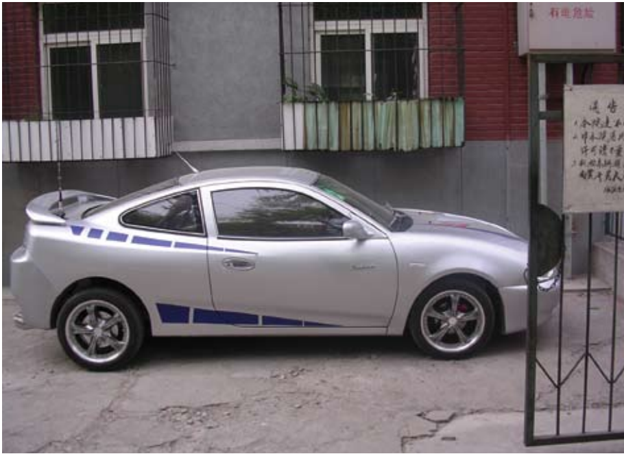
■ Most U.S. companies that seek enforcement of their intellectual property rights in China file suit in a civil court. China has established specialized intellectual property panels in its civil court system throughout the country.

you must register your intellectual property in China. The Department of Commerce has posted on its website an “IPR Toolkit—Intellectual Property Rights in China” ( www.stopfakes.gov ) that explains what is involved in registering your intellectual property in China. With respect to trademarks, you should know that China has a “first-to-file” system that requires no evidence of prior use or ownership, making it legal for an unrelated party to register your trademarks in China.