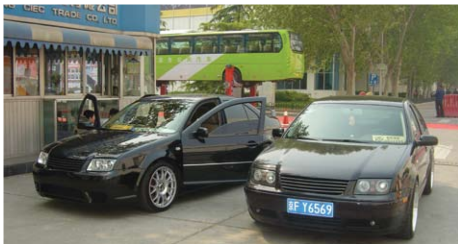
■ In large measure, the issues—quality, delivery and payment—you will face with a Chinese supplier are the same as with a U.S. supplier and the solutions are the same.

legal remedies if things go badly. If your supplier lets you down in the United States, your ultimate remedy is the U.S. court system. But with a Chinese supplier, several things are different. Unless the Chinese supplier has a presence in the United States, even if you sue and win in a U.S. court of law, it is probable that you will be unable to collect a judgment—either in the United States, where the defendant has no assets, or in China, where the courts and the authorities will not assist you in enforcing a monetary judgment obtained in the United States.