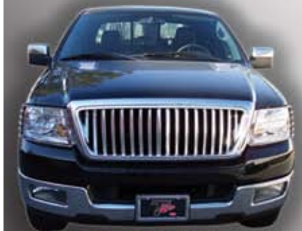
#09650 2004-07 FORD F-150 P/U